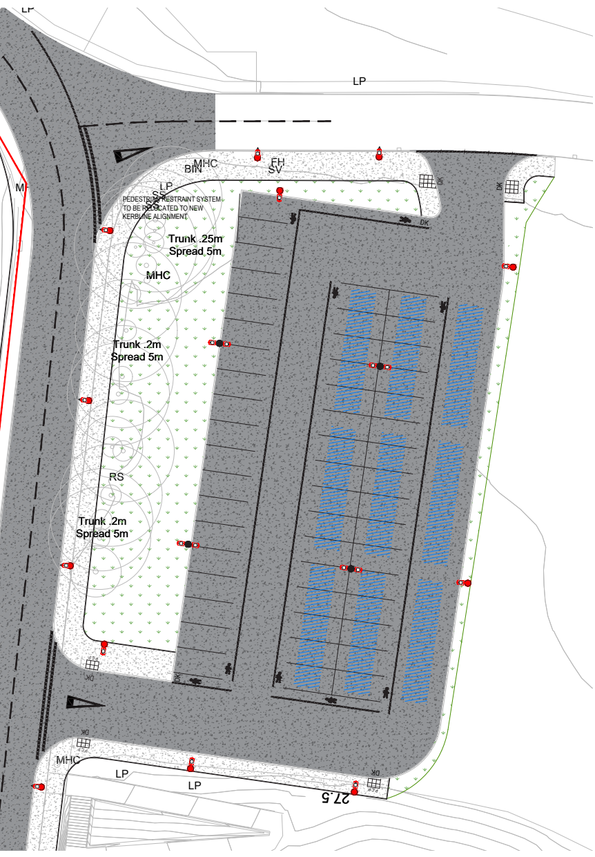
Fig 1.3 Propose Revised Design at Overflow Car Park