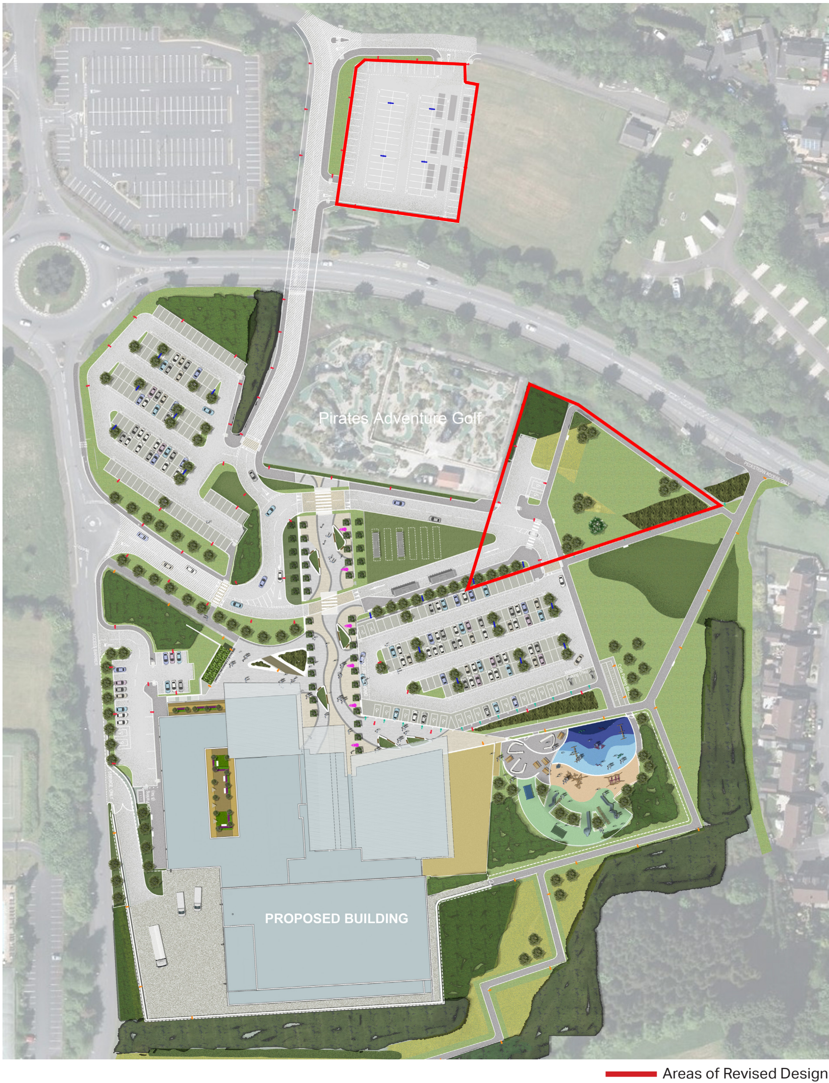
Fig 1.1 Previously Approved Site Layout